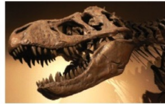
Tyrannosaurus rex skull and upper vertebral column, a victim of the fifth major extinction. Palais de la Découverte, Paris, photo by David Monniaux.

The previous mass extinctions were due to natural causes.